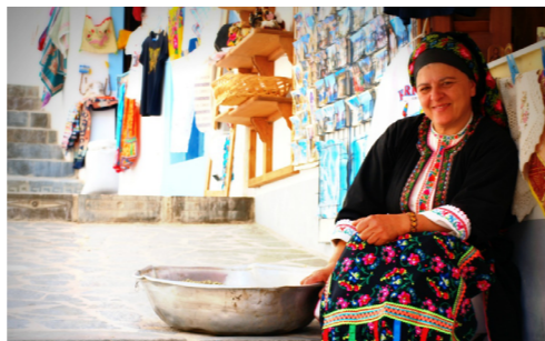
Uniquely in Greece, the women of Olympos still dress in traditional garb daily, providing a charming, living exhibition of traditional village life that does not exist anymore anywhere else in the country.

Karpathos has beauty and hospitality that is unmatched anywhere else in Greece. Despite it's beauty, it's secluded beaches and unspoilt character, Karpathos remains untouched by mass tourism.